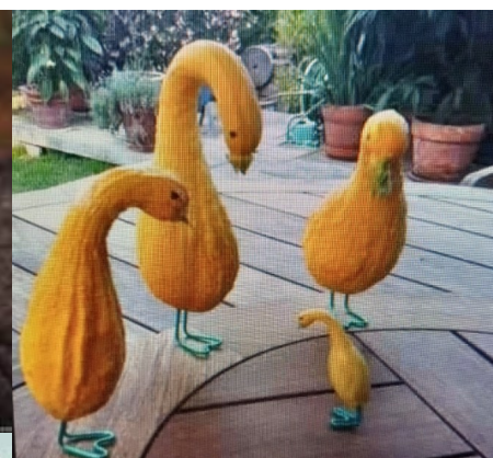
THE NEWCOMER IF THE MOST IMPORTANT PERSON IN THE ROOM

"A nun I know once told me she kept begging God to take her character defects away from her.