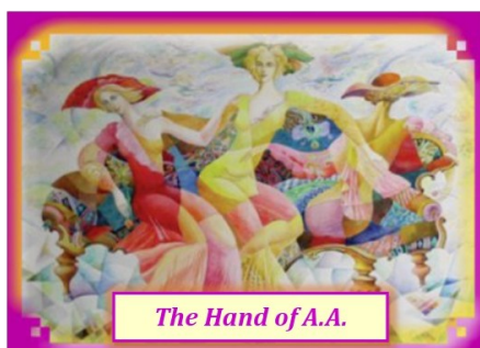
The Hand of A.A.

Speakers • Panels • Activities • Free Drawing